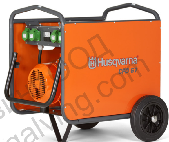
Compare Concrete placement equipment

Our local salesman can give you price quotes , book a demo or give you a call to talk more.